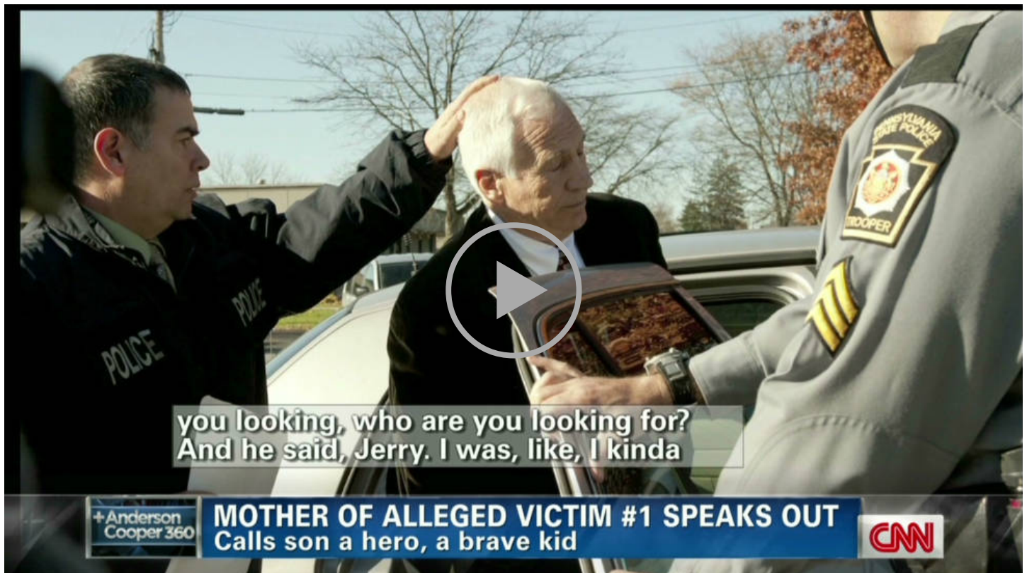
Alleged Penn State victim's mother talks 05:56