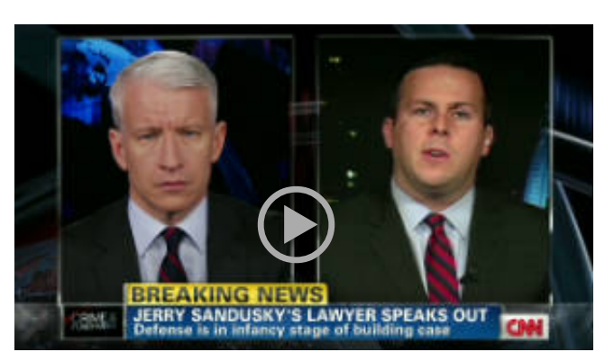
Boyle: Penn. abuse law not strong enough 02:50