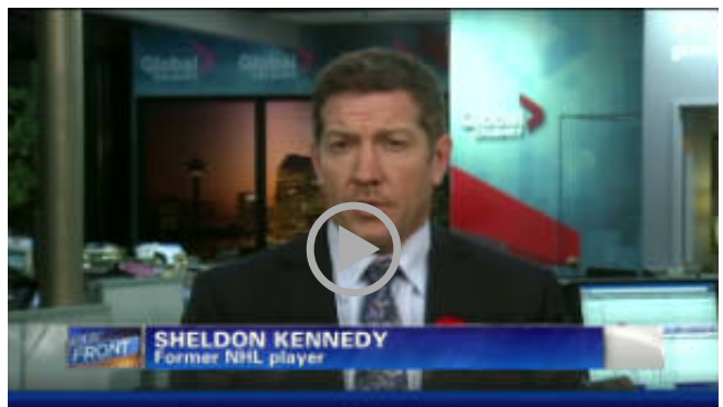
Abuse advocate: Paterno rightly fired 02:42