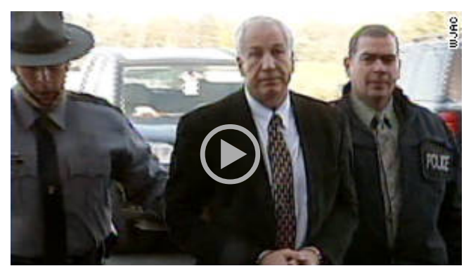
Sandusky lawyer denies charges 01:54